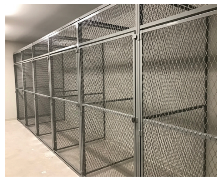
Install individually, or arrange in multiples for larger spaces. Padlocks sold separately.

Padlock: 2" Hardened Steel with Plated Shackle (sold separately)