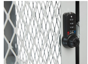
Combination Key Lock