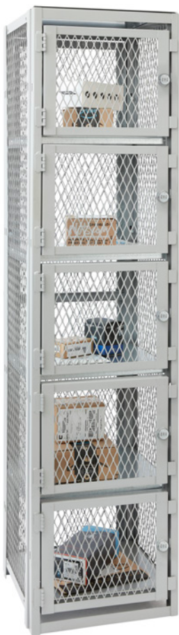
FRONT Multi-Door Access