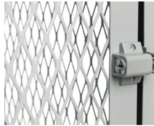
Keyed Pin Lock